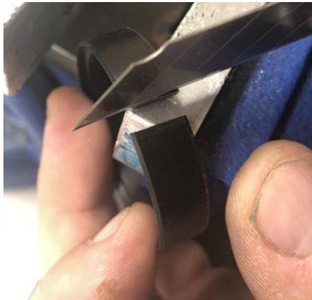
EXAMPLE OF THE RING CUTTING WITH CUTTER