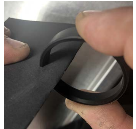
EXAMPLE OF THE RING ADAPTING WITH SANDPAPER

FOR WP 48 mm FORK WITH KYB SPRING CONVERSION, THE PDS MODEL IS THE SAME AS KYB. YOU JUST NEED TO CUT OFF 1.00 mm ON THE PLASTIC RING TO BE ADAPTED TO THE CHROME SHAFT WHICH HAS A SMALLER ID.